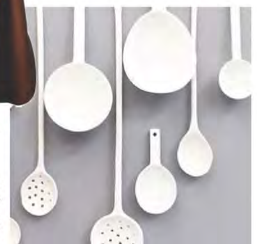
PORCELAIN SPOON INSTALLATION BY ELLEN COLE & NIELS DATEMA