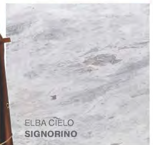
ELBA CIELO SIGNORINO