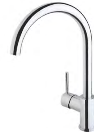
MINIMAX S SINK MIXER VITRA GLOBAL